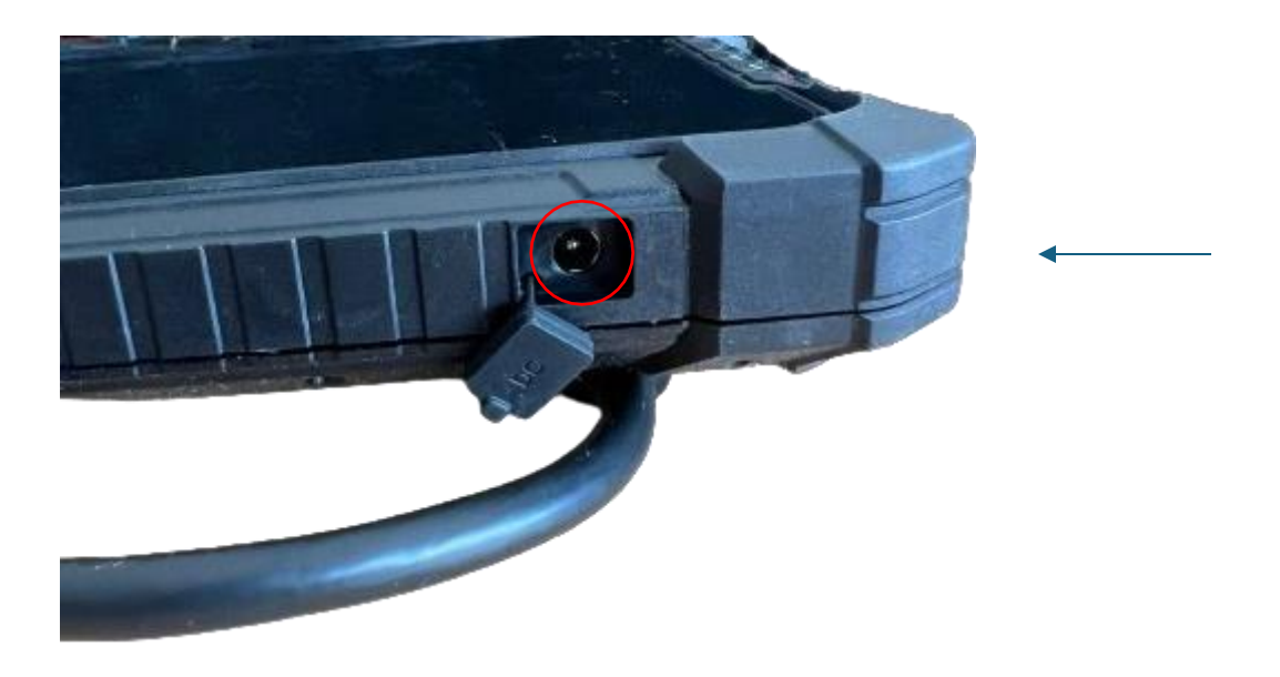
Fig. 4 - BR001 device power connector

Warning: The battery must be securely positioned either in the vehicle or on the back of the BR001 device.