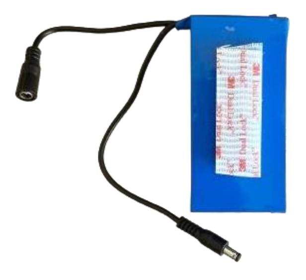
Fig. 1 – The emergency battery

The emergency battery is required to supply power to the device when the vehicle does not provide it.